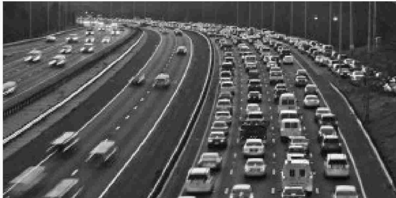
State Highway Administration officials are warning Marylanders to expect major congestion in and around the D.C. metro area during the presidential inauguration.